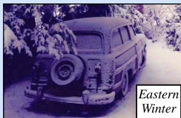
Eastern Winter -2015- Western Winter

SATURDAY MAY 23rd PEDAL CAR CONTEST TOUR