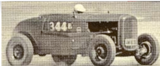
101mph 1932 Model B Record Run -1948